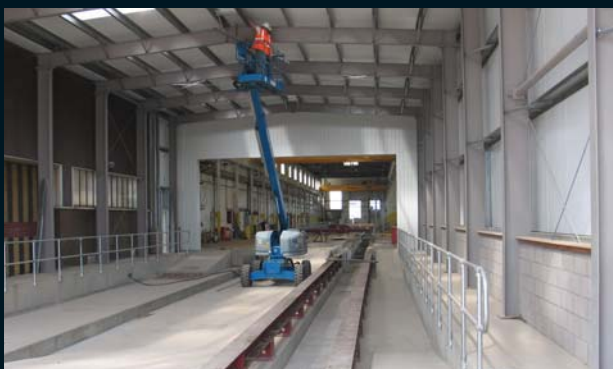
All works shown have used Right Angles in their construction